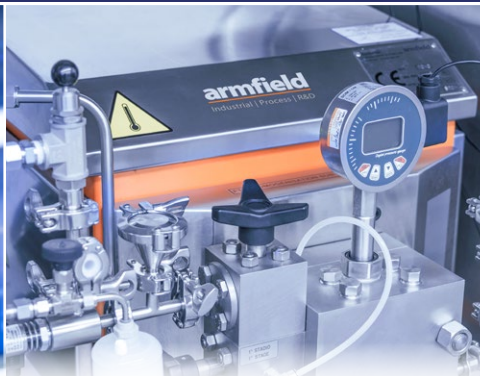
Integral homogeniser option