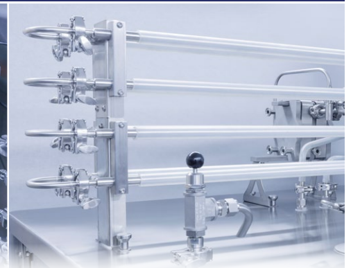
Two-stage tubular heat exchanger