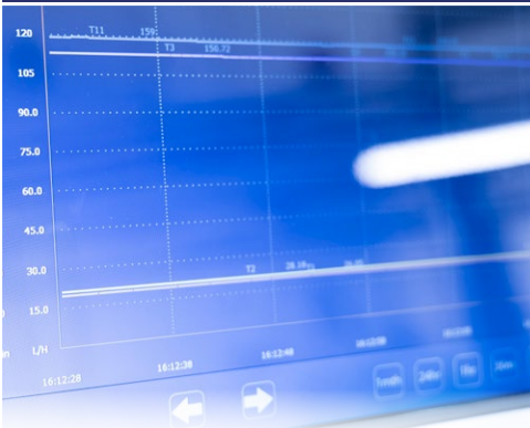
Integrated data logging