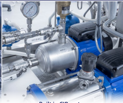
Built in CIP system