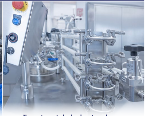
Two-stage tubular heat exchanger