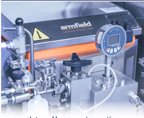
Integral homogeniser option