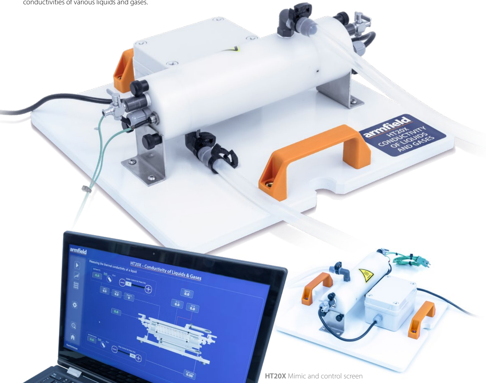
HT20X Mimic and control screen

The Armfield Conductivity of Liquids and Gases unit has been specifically designed to enable students to measure and compare the thermal conductivities of various liquids and gases.