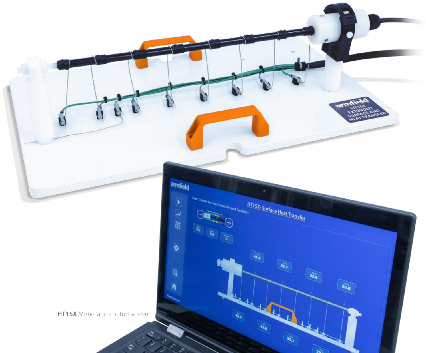
HT15X Mimic and control screen

Thermocouples at regular intervals along the rod allow the surface temperature profile to be measured.