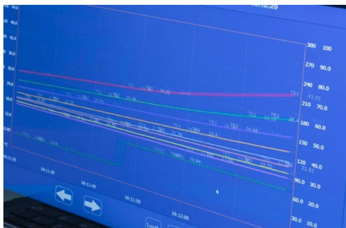
Graph display screen, has many features and is exportable to Excel in .vts file format