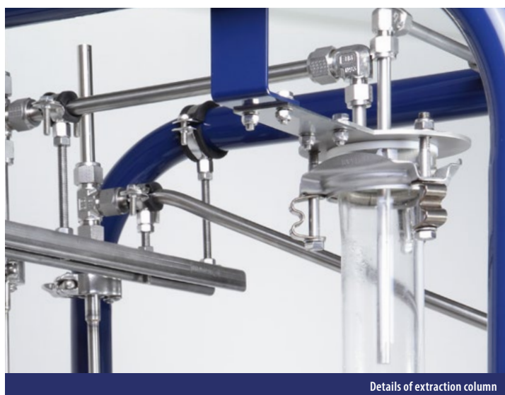
Details of extraction column

Computer: A Windows PC (not supplied) running Windows 7 or later, with USB port is required if running the data logging software