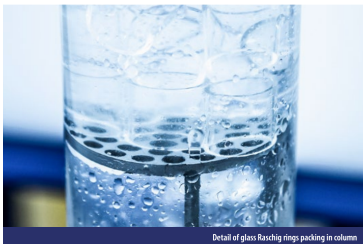
Detail of glass Raschig rings packing in column