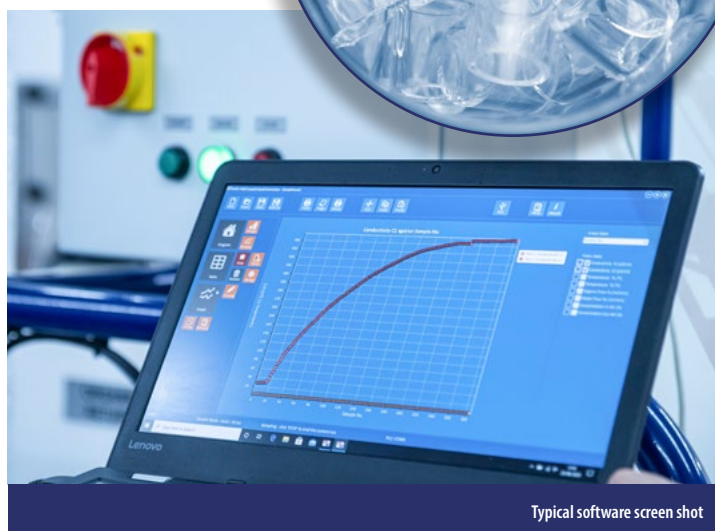
Typical software screen shot