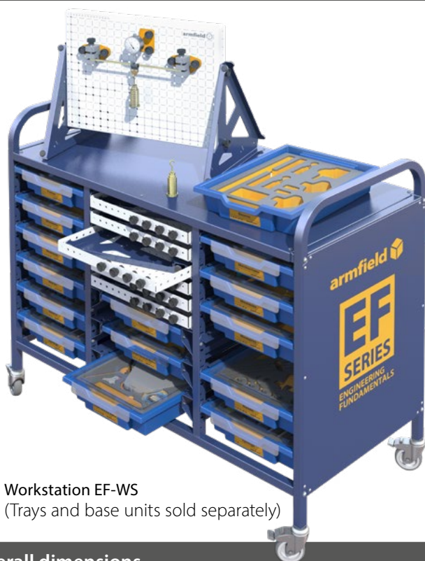
Workstation EF-WS (Trays and base units sold separately)