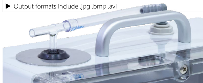
Cepiler tube detail