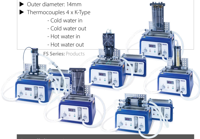
FS Series: Products