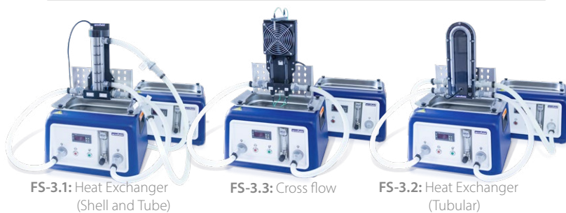
FS-3.1: Heat Exchanger (Shell and Tube)