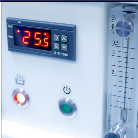
Configurable as hot or cold water supply