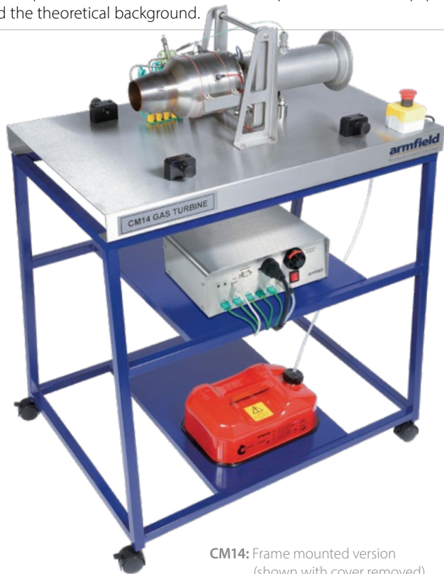
CM14: Frame mounted version (shown with cover removed)

The user has access to a wide range of data acquisition, graph-plotting and display functions. As well as the standard graph-plotting functions, a special routine has been written to display H - S diagrams (Entropy - Enthalpy diagrams), which are of particular interest in thermodynamics. Full help text is included on both the operation of the equipment and the theoretical background.