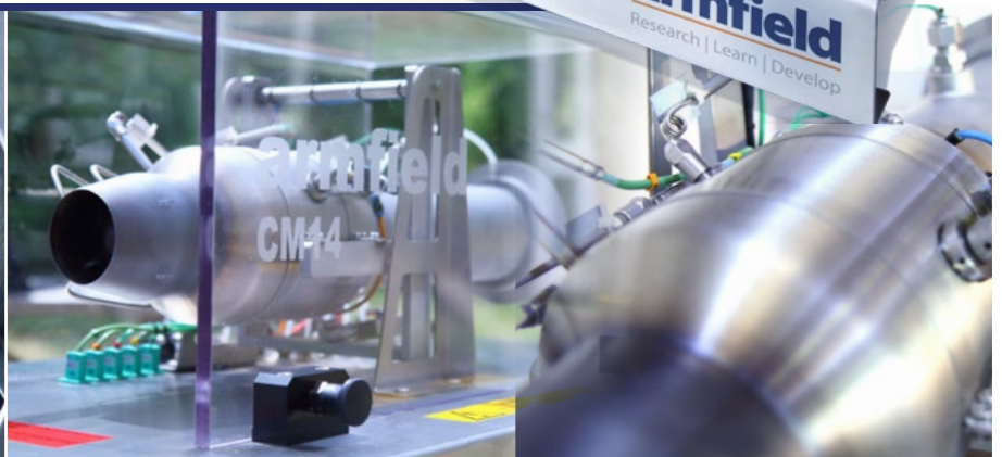
CM14 frame-mounted version. With cover fitted