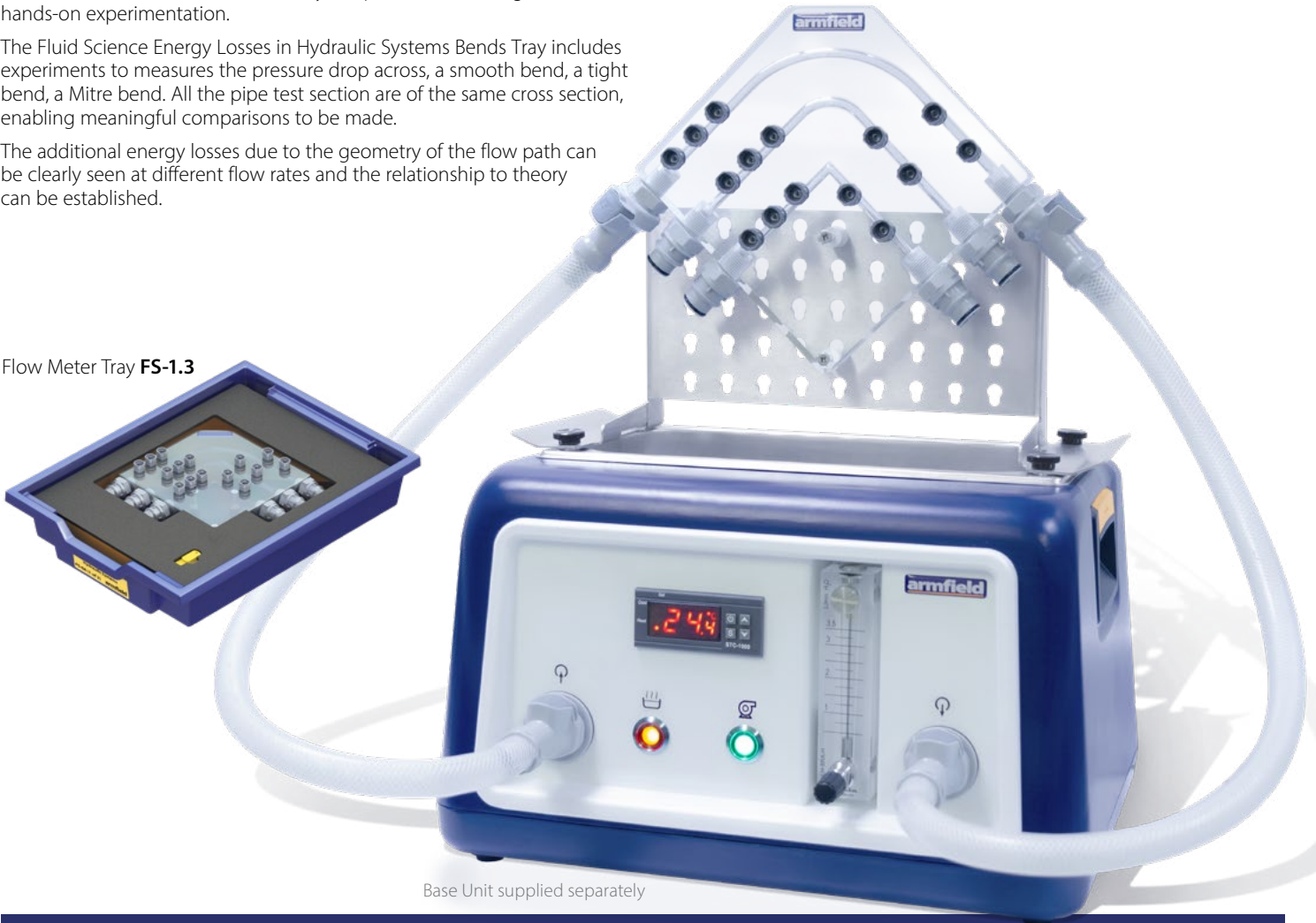
Base Unit supplied separately