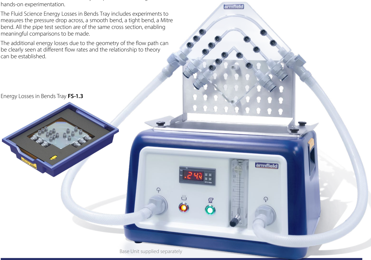
Base Unit supplied separately