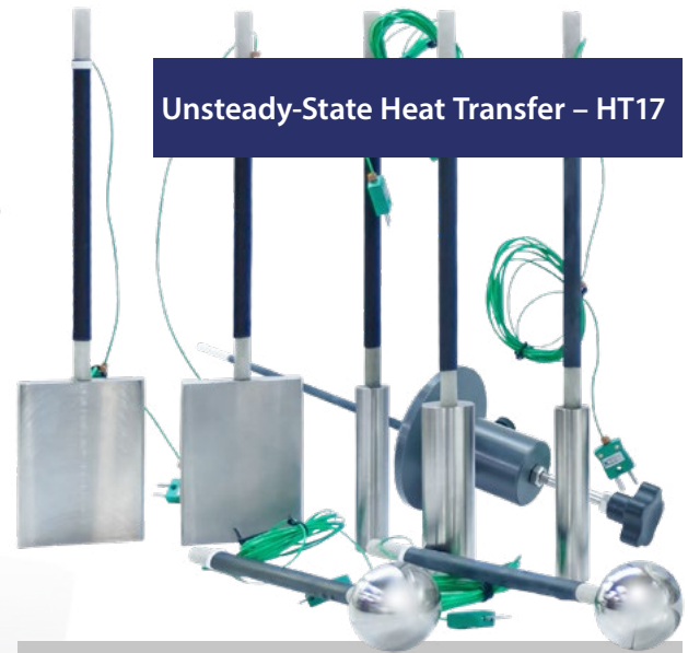
Unsteady-State Heat Transfer – HT17