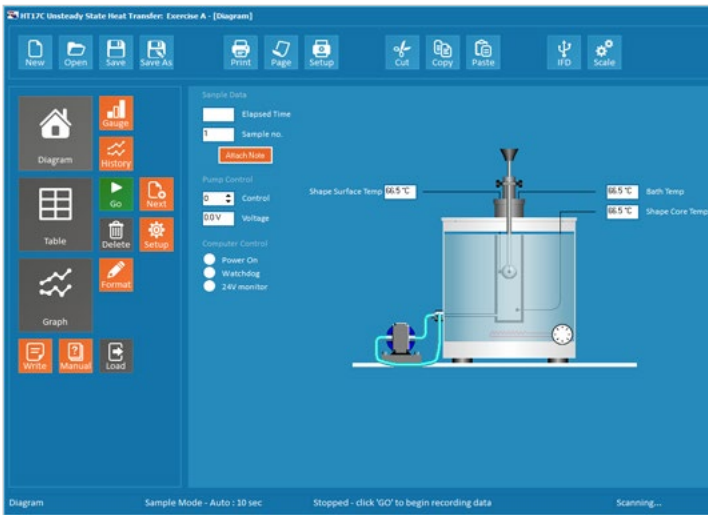
Typical mimic diagram showing spherical shape immersed in the hot water bath