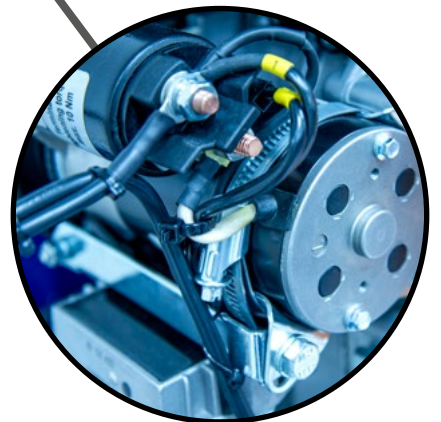
Diesel Engine with Electric Start Sensor Prepared CM20-20-3