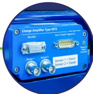
Pressure Sensor AMP OPTIONAL - CM20-12-12