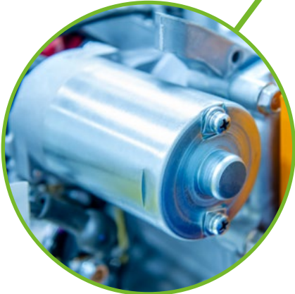
Petrol Engine with Electric Start CM20-10-1