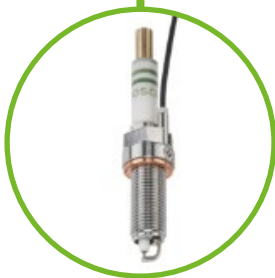
Petrol Engine Indicator Set* OPTIONAL - CM20-10-12