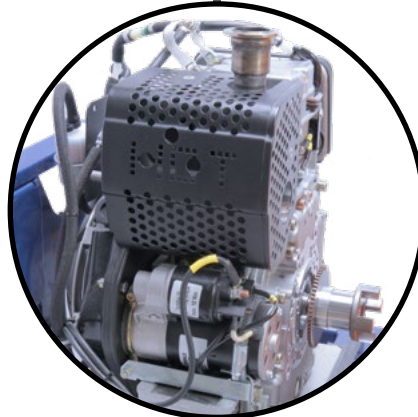
Diesel Engine with Electric Start CM20-20-1