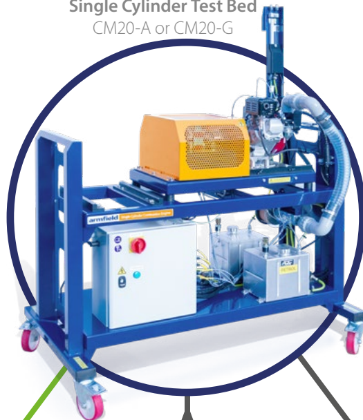
Single Cylinder Test Bed CM20-A or CM20-G