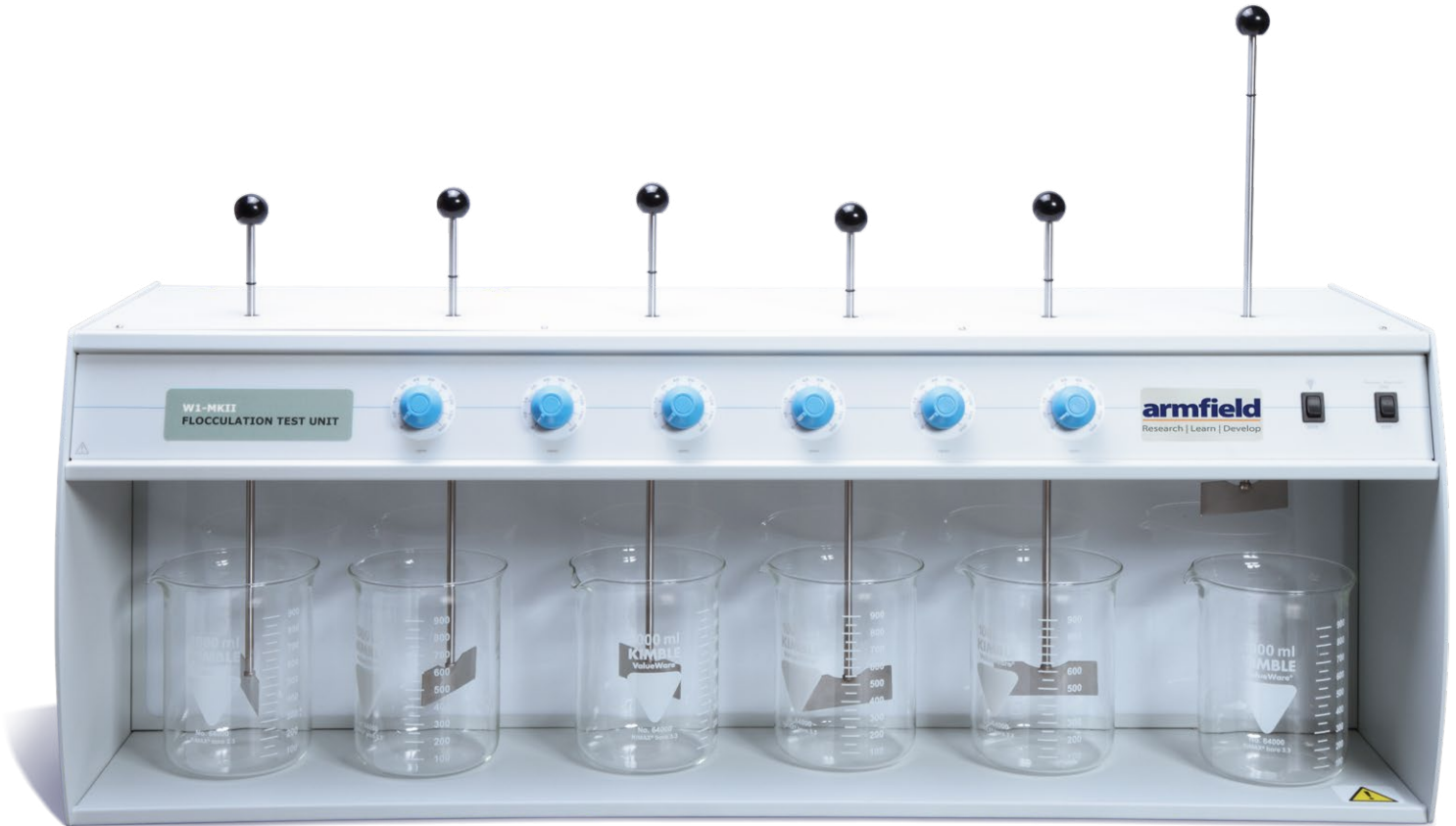
Six independent variable speed stirrers

SIX VARIABLE SPEED STIRRERS INCLUDES SIX BEAKERS, A TEST TUBE STAND AND SIX TEST TUBES