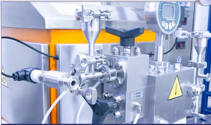
Twist controller, dtalogging blah blah