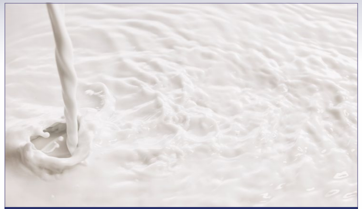
Milky milky nom nom!