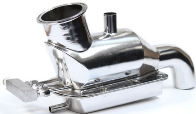
The FT80-60 Fluid Bed Cooler Accessory

Note: Many spray-chilling applications also require the Trace Heating Accessory, FT81-65.