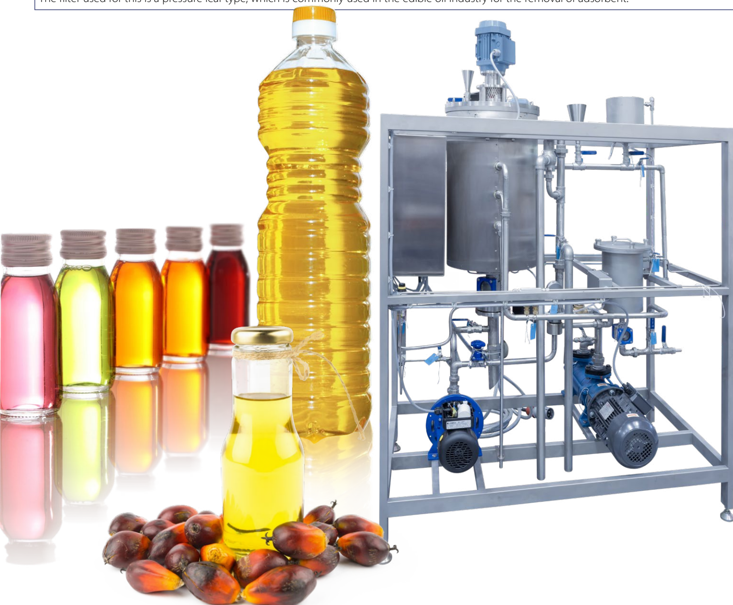
Example product, palm oil, essential oils, vegetable oil

The filter used for this is a pressure leaf type, which is commonly used in the edible oil industry for the removal of adsorbent.