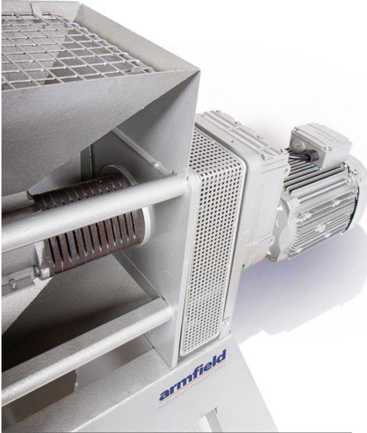
FT28 Oil Extraction Screw Press, picture showing hopper & powerful motor