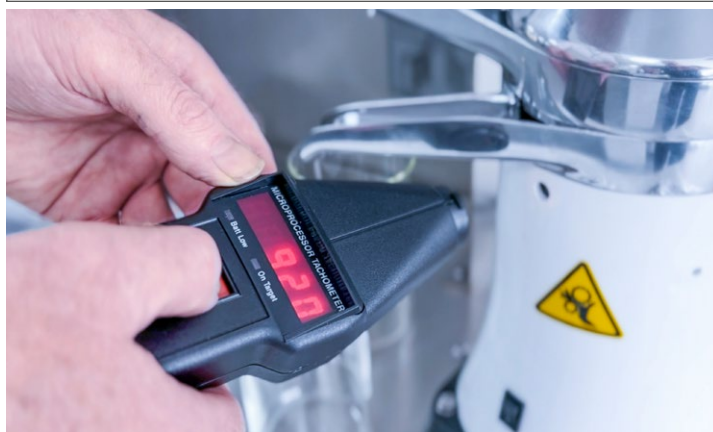
FT15 Optical Tachometer