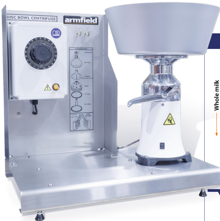
Diagram showing the separation of cream from milk with a disc bowl centrifuge

THROUGHPUT 125 LITRES PER HOUR 12 MOTOR SPEED UP TO 10,000rpm