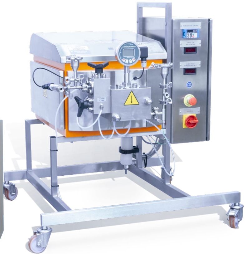
FT91 Homogenisation Subsystem