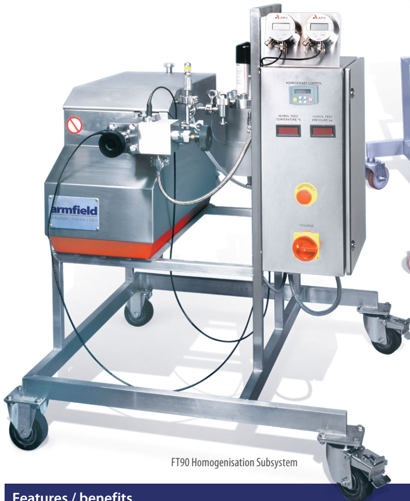
FT90 Homogenisation Subsystem